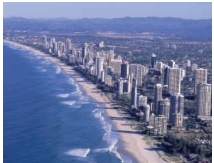
The Worldwide Center for Organizational Development is based near LAX Airport in Los Angeles, CA. Subsidiaries of the WCOD are also located in the UK and the Gold Coast in Australia (pictured above).

Interview Generator® An online interview-building system for use by individuals who interview other people in order to evaluate and/or better understand their work-related skills, knowledge, abilities and competencies.